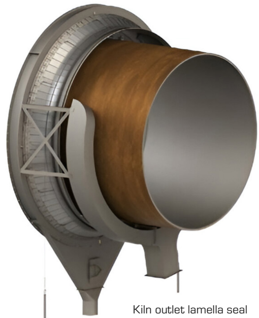
Kiln outlet lamella seal